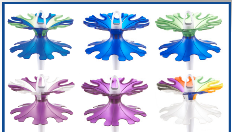
Available in solid or a combination of colors