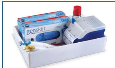
Use for storage or transport of laboratory products