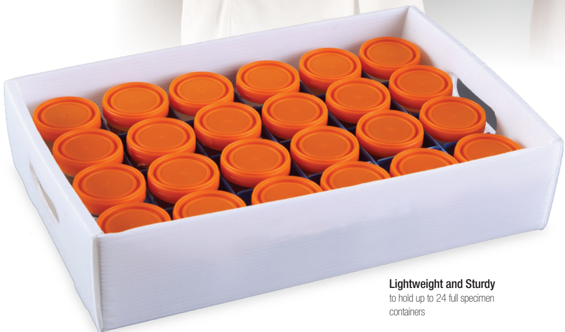
Lightweight and Sturdy to hold up to 24 full specimen containers