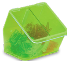
Benchtop Dispensing Bin 2 Compartment HS23411 Neon Green 7.1 x 6.1 x 6.5 in 18 x 15.5 x 16.5 cm