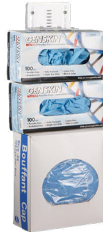
Flexible Glove Box Holder

Adjustable to hold a variety of PPE items with varying box sizes Wall mount only, hardware included