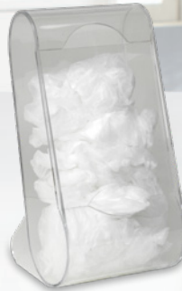
Soft Cover Dispenser HS1040C Clear 8.9 x 6.4 x 6.1 in 22.7 x 16.2 x 15.6 cm