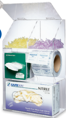
Workstation Storage Bin HS234523 Clear 10.4 x 5.4 x 17.3 in 26.5 x 13.7 x 44 cm