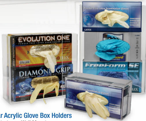
Clear Acrylic Glove Box Holders Countertop or Wall Mount