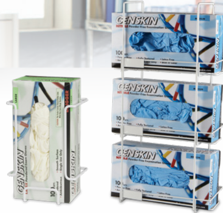
HDPE Coated Wire Glove Box Holders Countertop or Wall Mount