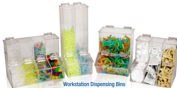
Workstation Dispensing Bins Clear, 4 Sizes Available