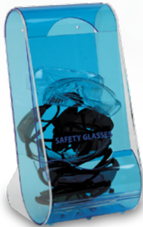
Large Safety Glasses Dispenser HS1040A Neon Blue 8.9 x 6.4 x 6.1 in 22.7 x 16.2 x 15.6 cm