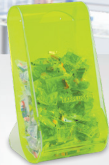
Earplug Dispenser HS1040B Neon Green 8.9 x 6.4 x 6.1 in 22.7 x 16.2 x 15.6 cm