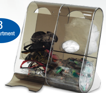
3-in-1 Dispenser HS1042 Grey 16 x 16 x 8 in 40.6 x 40.6 x 20.3 cm