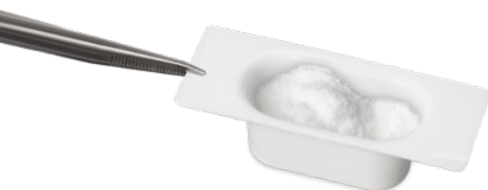
Easy to Handle Tabs

Made of Polystyrene Food Grade Compliant